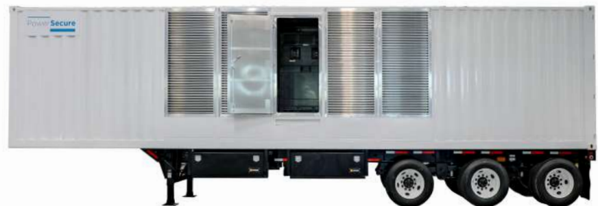
1250kw T4F PowerBlock Mobile *Image shown may not reflect actual configuration.

The PowerBlock® Mobile Solution provides the customer with a reliable source of power anytime and at any location. This product can even be used to assist neighboring communities during emergencies. The PowerBlock Mobile generator is a modular, movable solution.